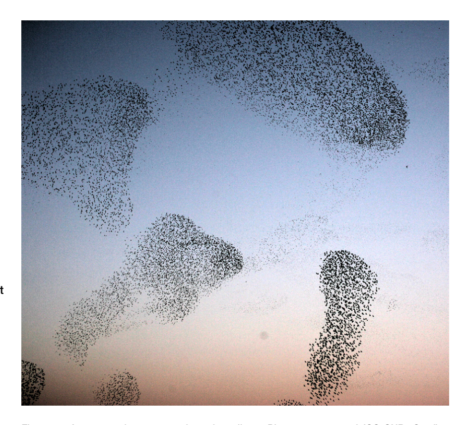
Figure 1. A spectacular murmuration of starlings.

Where can I see a murmuration? The mesmerizing act is typically seen at dusk throughout Europe, between November and February. Each evening, shortly before sunset, starlings can be seen performing breathtaking aerial manoeuvres, before choosing a place to roost for the night. These range in number from a few hundred to tens of thousands of birds. Murmurations exhibit strong spatial coherence and show extremely synchronized manoeuvres, which seem to occur spontaneously, or in response to an approaching threat, like hawks or peregrine falcons.